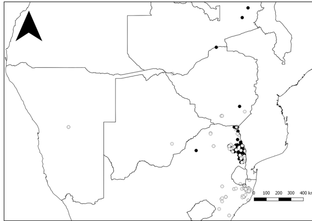
Figure 1. Map showing the locations of all re-sightings of African white-backed vultures tagged in this study. The black and grey circles represent individuals that were originally tagged in the Greater Kruger National Park and KwaZulu-Natal regions, respectively. The number of birds tagged in each region in each year is presented to Table S1. This map was created in Quantum GIS (Quantum GIS Development Team (2016). Quantum GIS Geographic Information System. Open Source Geospatial Foundation Project. http://qgis.osgeo.org ).

bird species being traded in Africa 19 . Although the exact methods used to trap vultures for such traditional markets are not known, at least some of them would have been poisoned 20 .